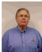
(Please see back page for project testimonial.)