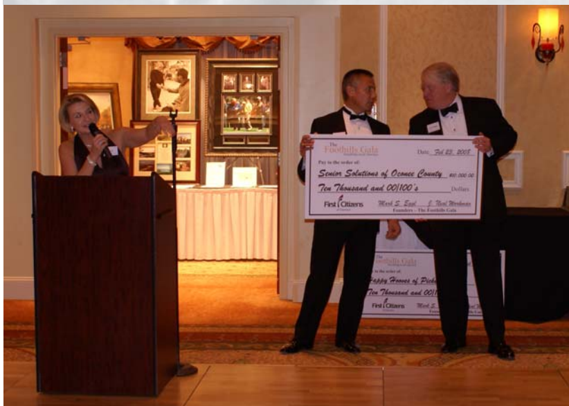
Senior Solutions of Oconee County