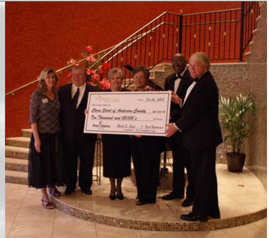
Clean Start of Anderson County

Each charity received a donation check for $10,000 to assist with their ongoing work in the community.