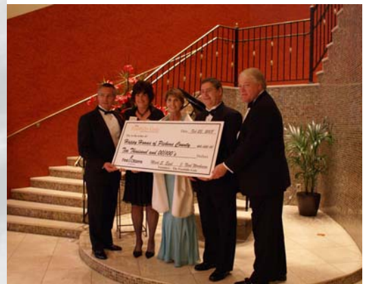
Happy Hooves of Pickens County