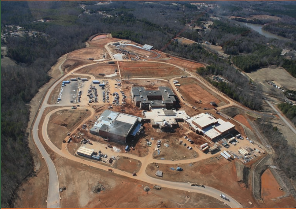
PICKENS HIGH SCHOOL - PICKENS, SC

TREHEL CORPORATION | 1376 TIGER BLVD. STE. 104 CLEMSON, SC 29631 - 864.654.6582 | 408 E. NORTH ST. GREENVILLE, SC 29601 - 864.284.9439